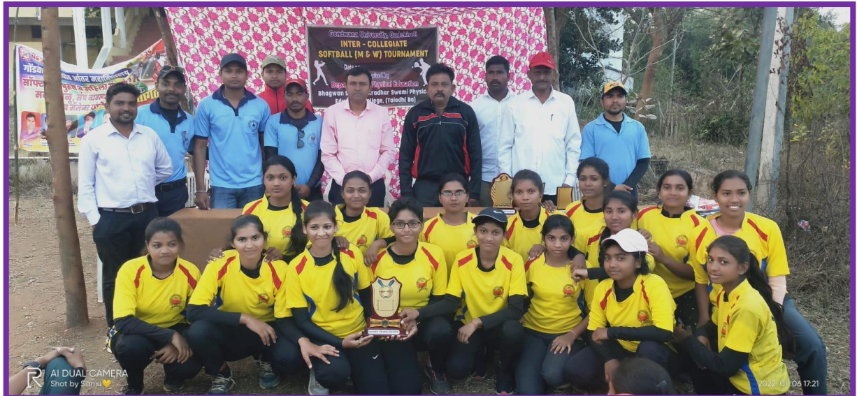
Softball Women Team 1 st Place