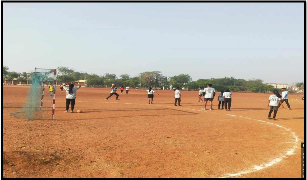
Handball Play Ground