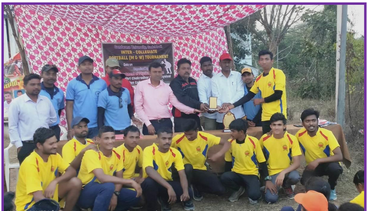
Softball Men Team 3 rd Place