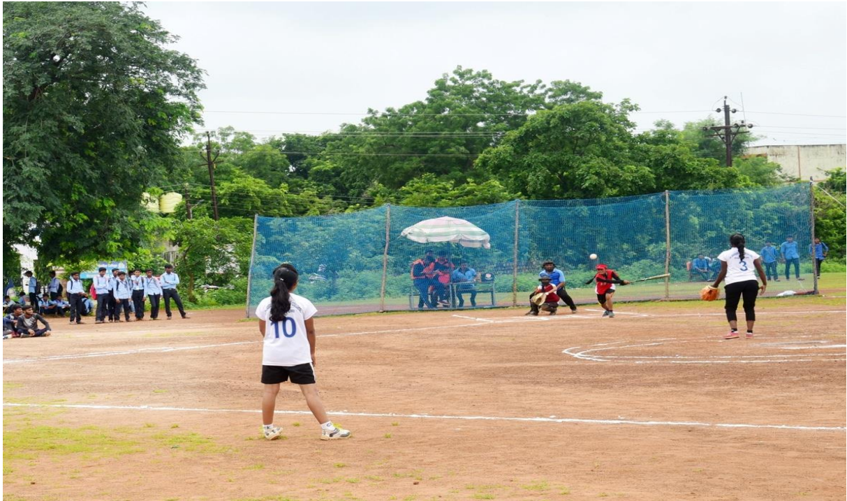
Softball Play Ground