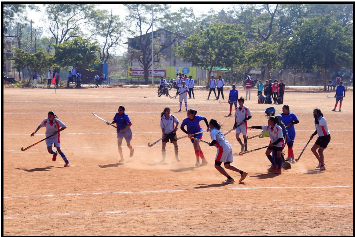
Hockey Play Ground