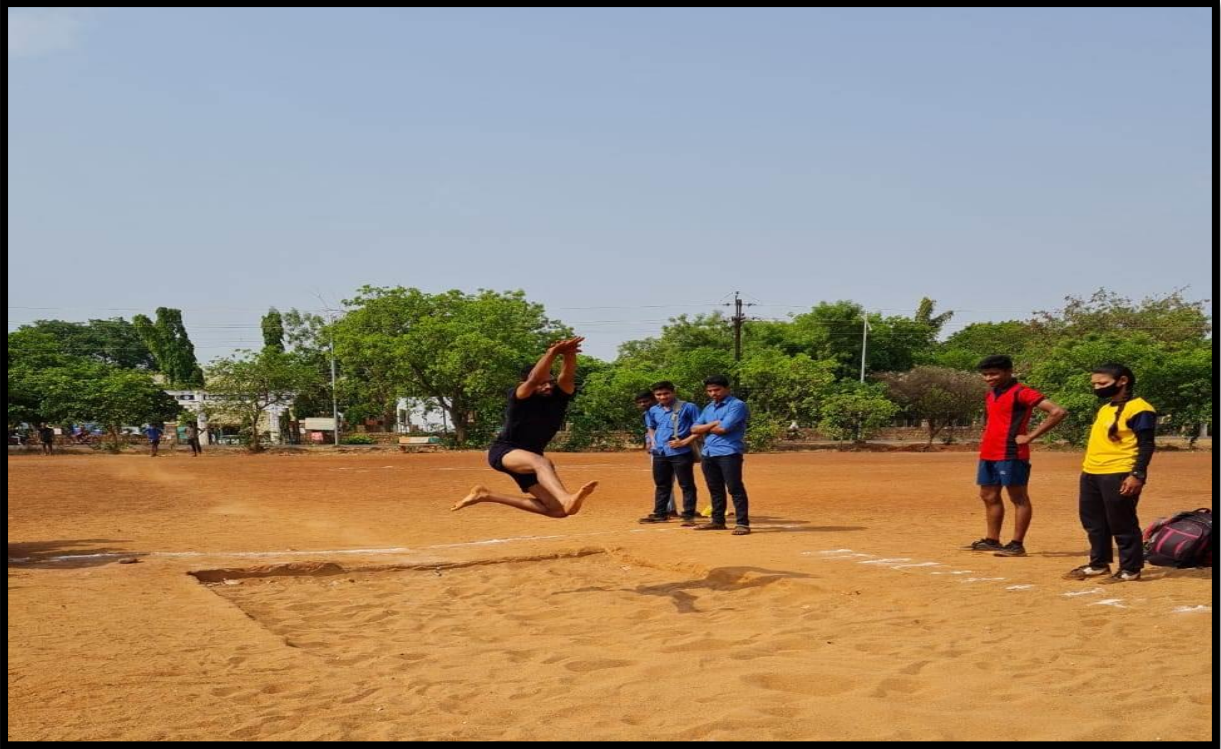
Athletics Long Jump