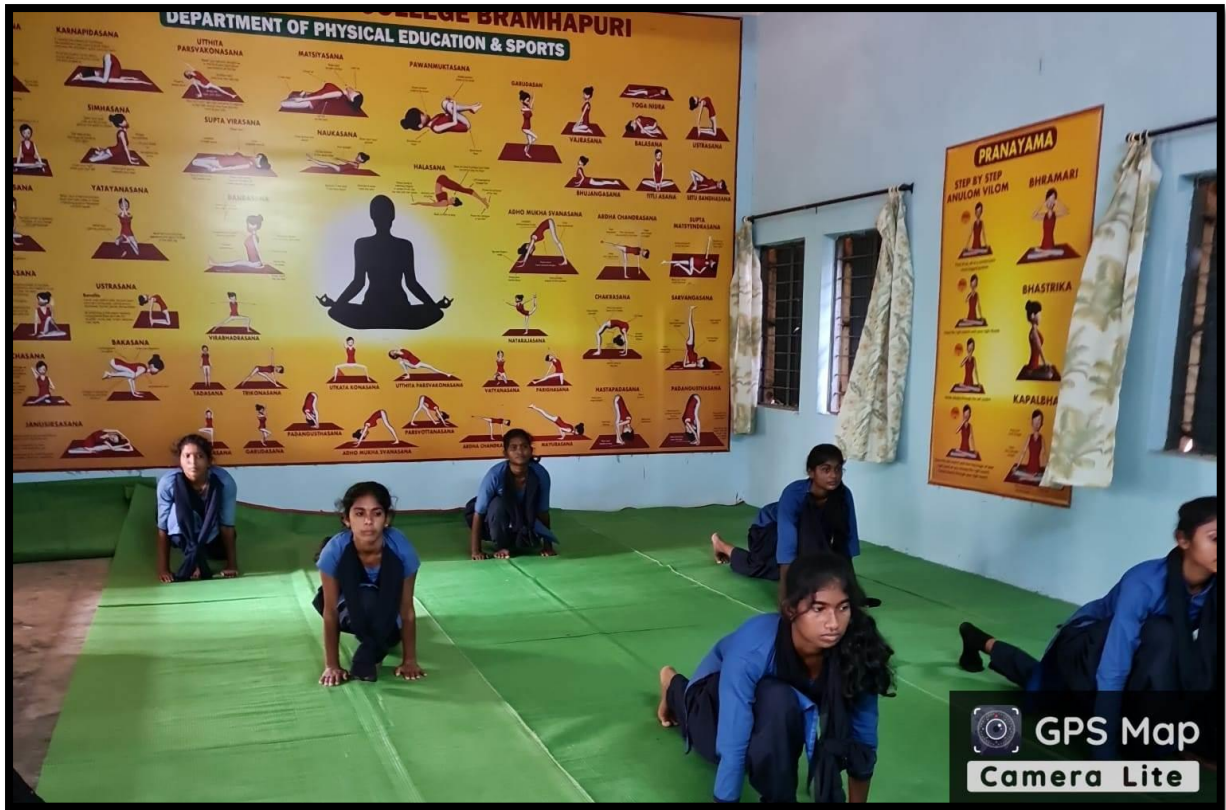
Yoga & Meditation Hall