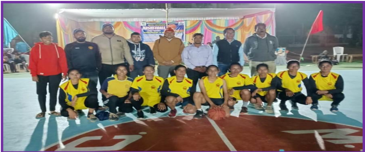
Basketball Women Team 1 st Place