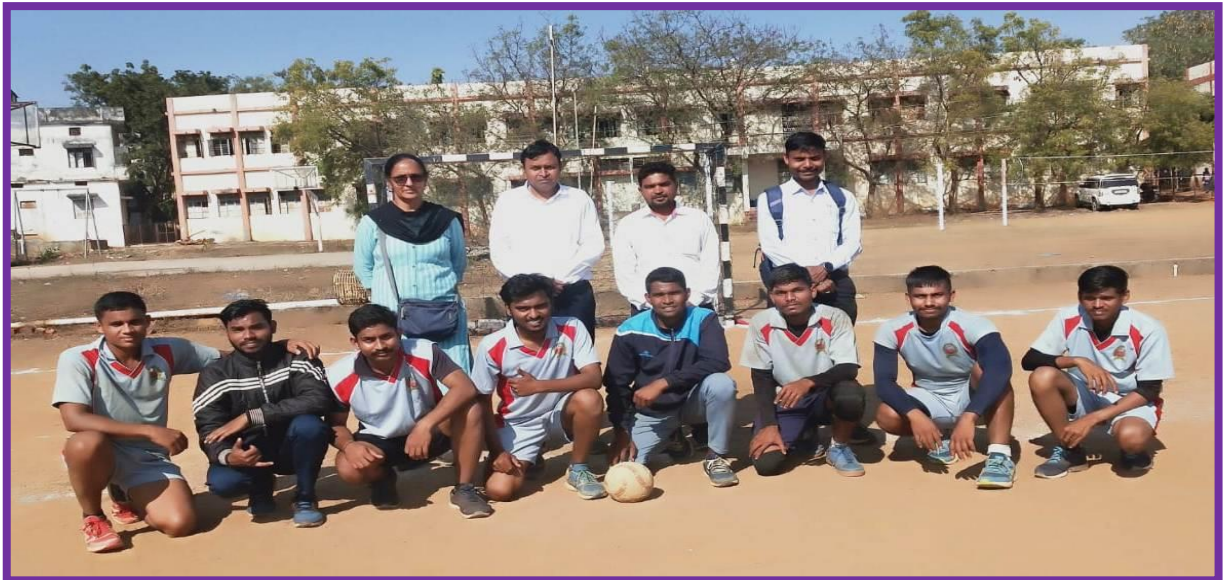
Handball Men Team 3 rd Place