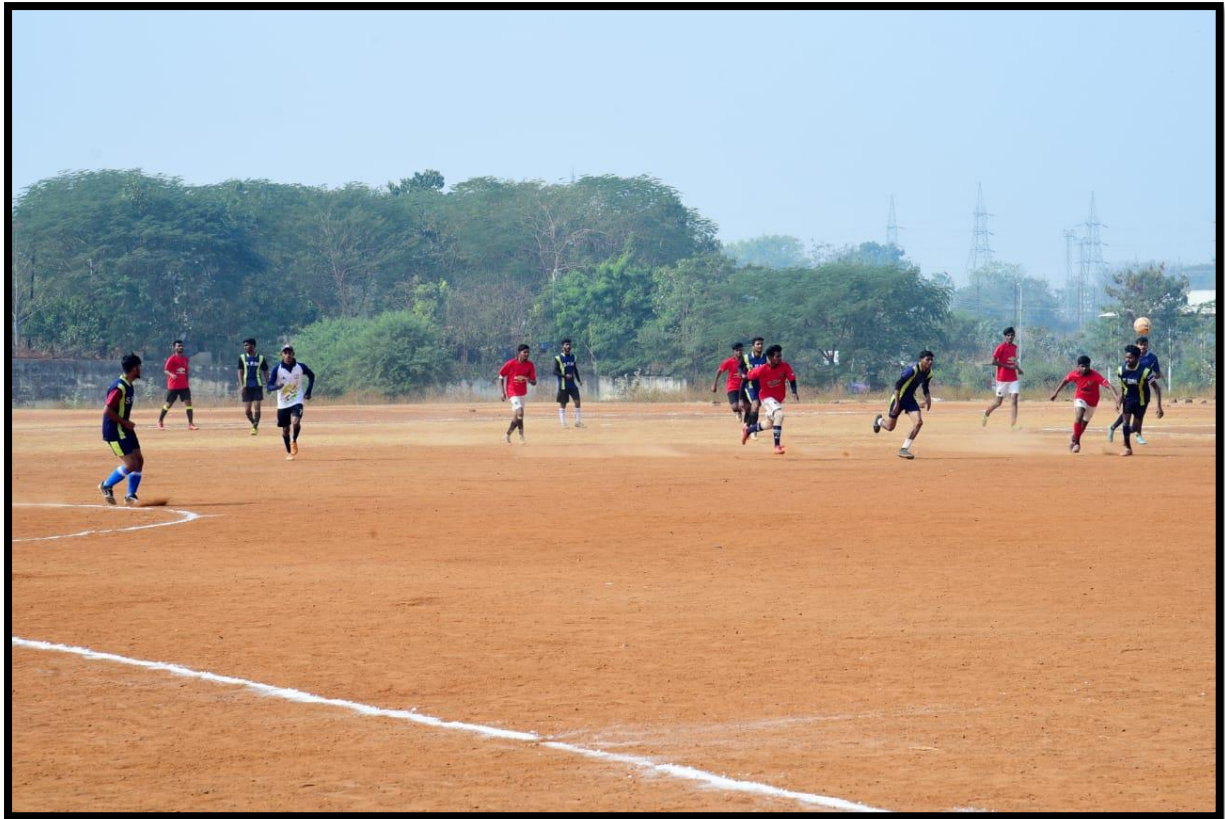
Football Play Ground