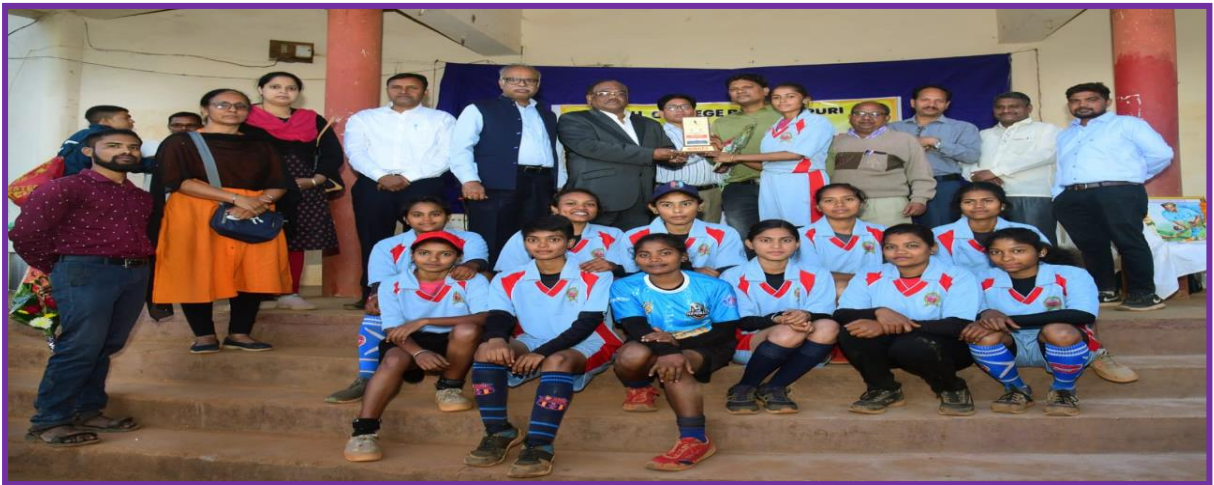
Hockey Women Team 1 st Place