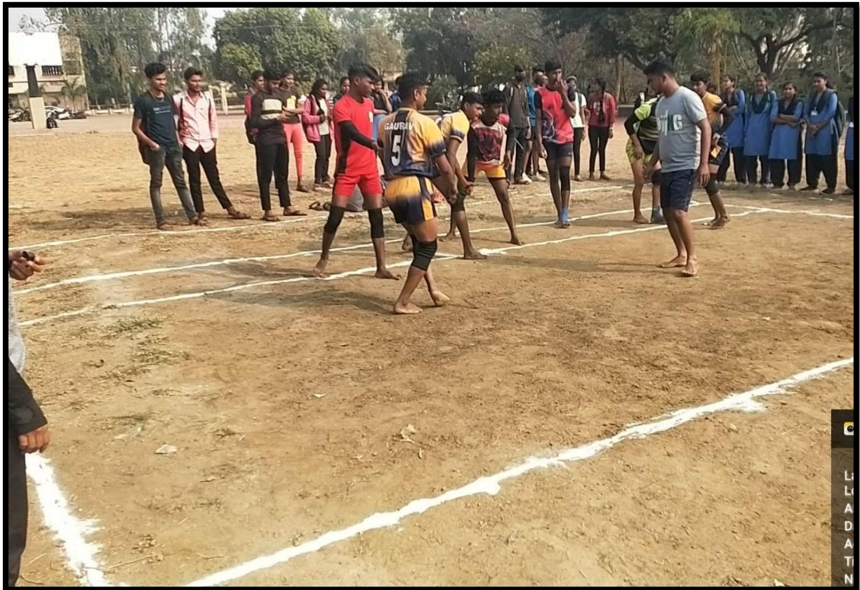
Kabaddi Play Ground