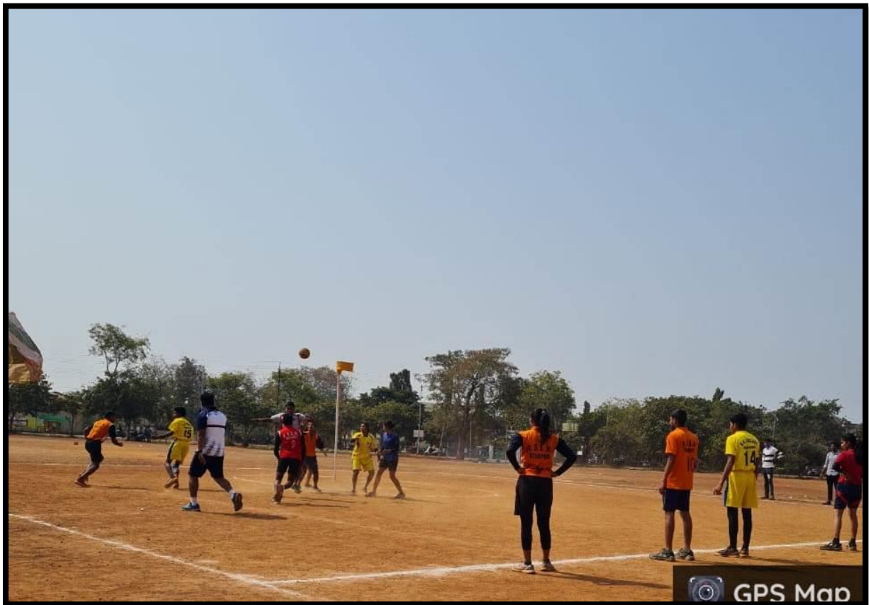
Korfball Play Ground