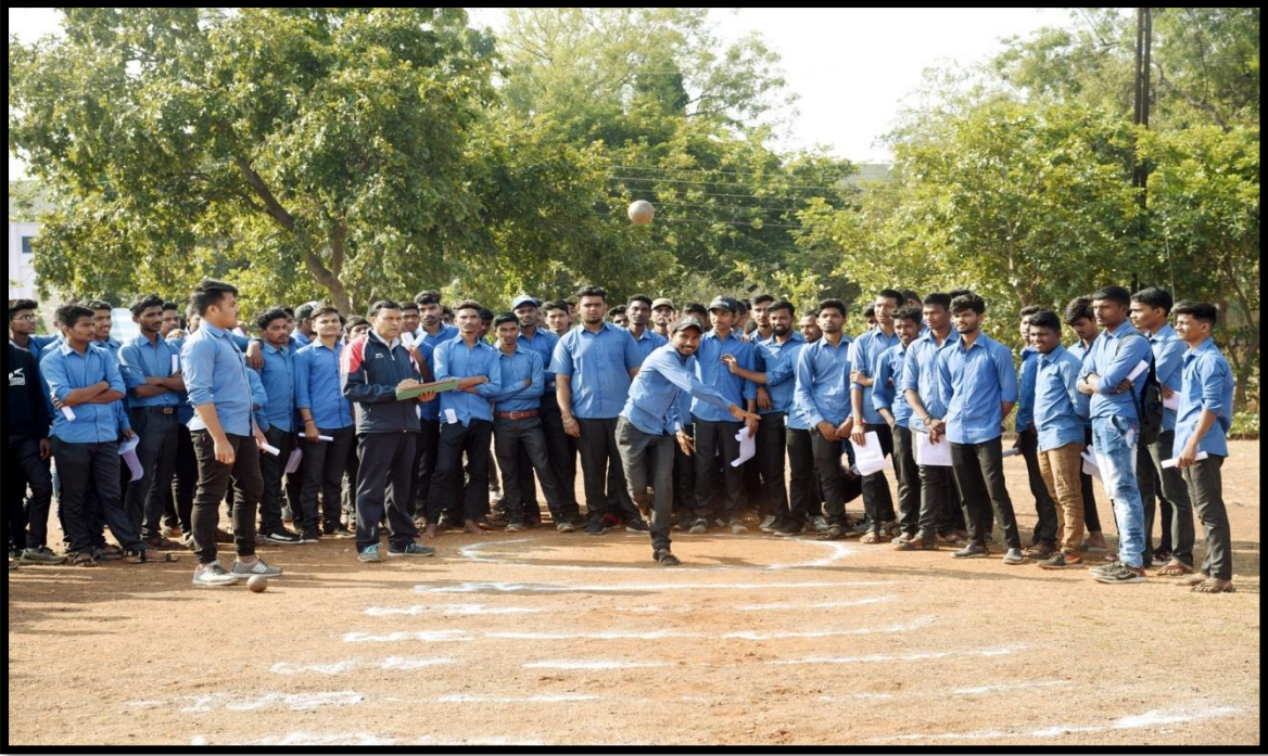
Physical Efficiency Test