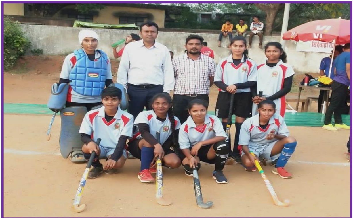
Indoor Hockey Women Team 2 nd Place