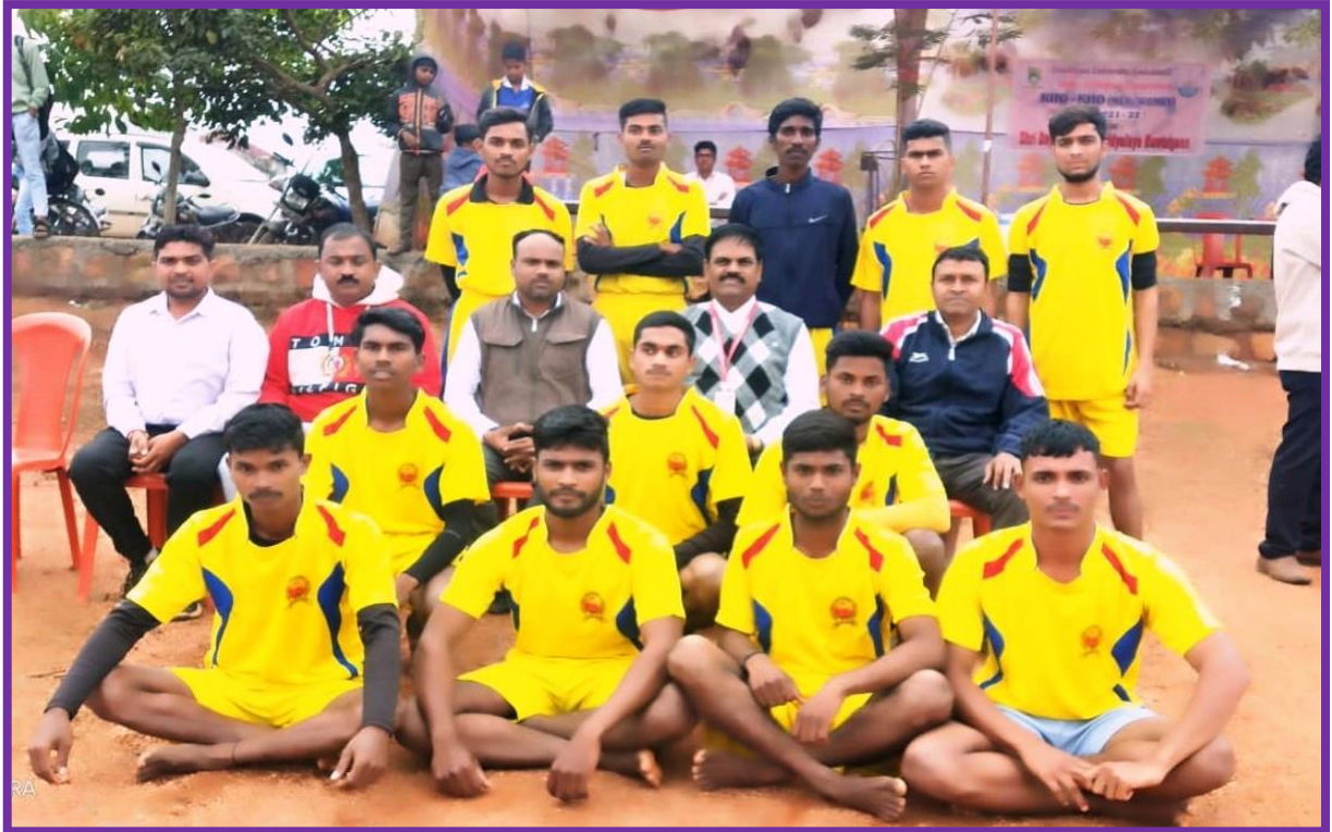
Kho-Kho Men Team 3 rd Place