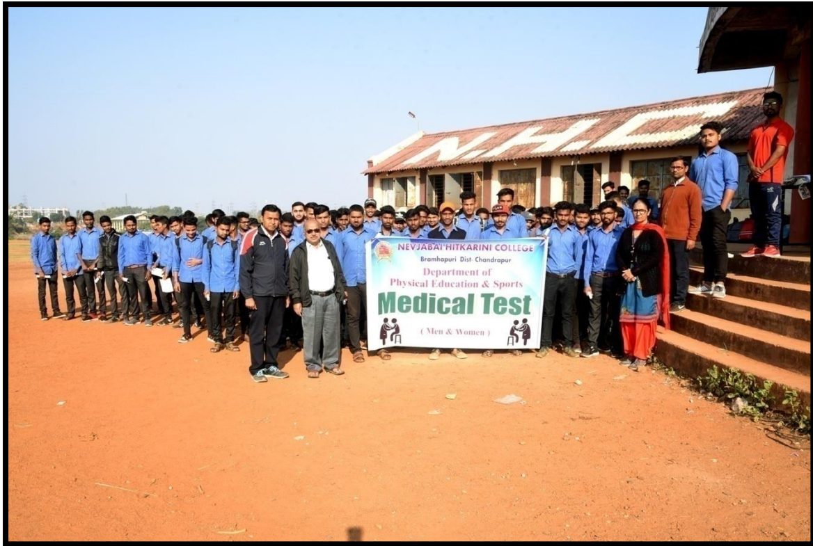
Medical Efficiency Test