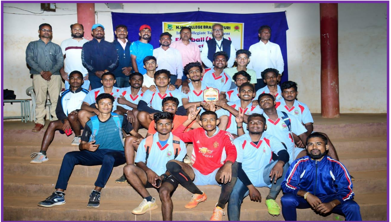
Football Men Team 2 nd Place