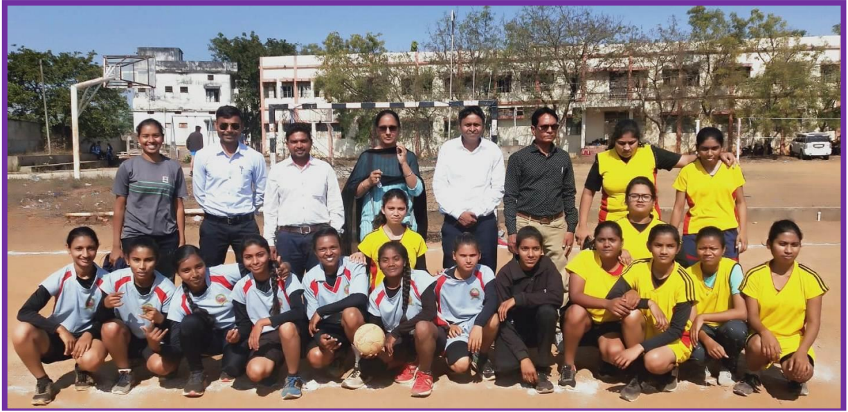
Handball Women Team 1 st Place