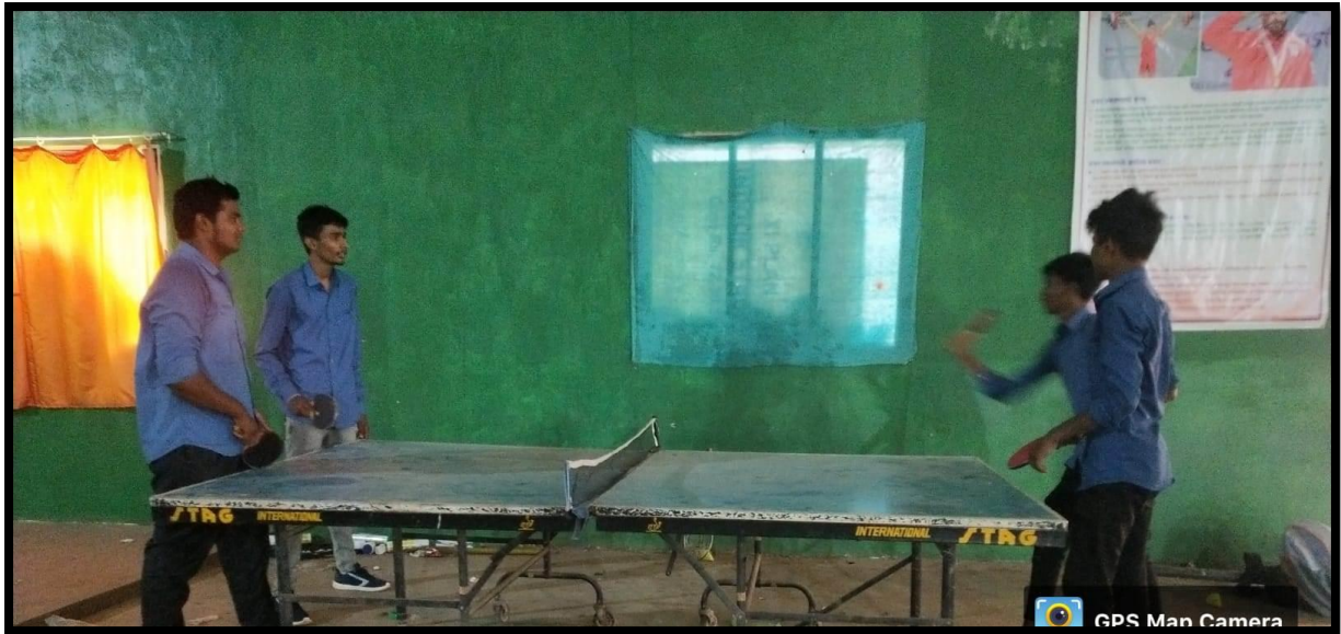
Indoor Stadium Table Tennis