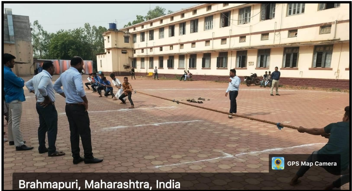
Tug of War Ground