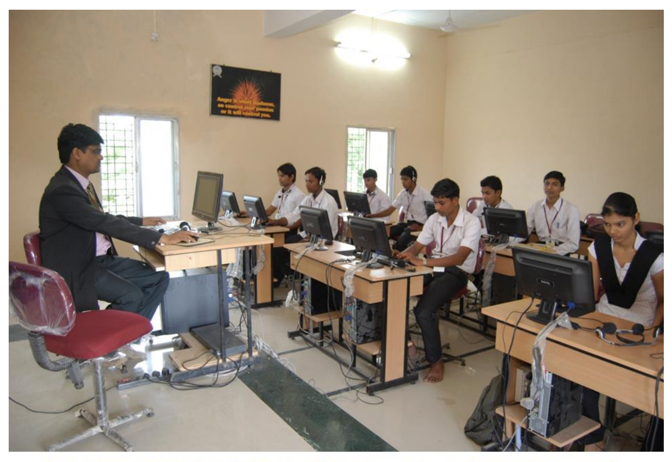
English Language Lab (Installed Under UGC sponsored Career Oriented Programme)