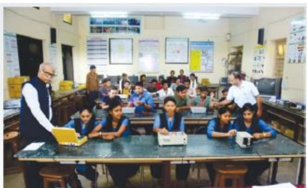
Smart Classroom-cum- lab, Department of Electronics