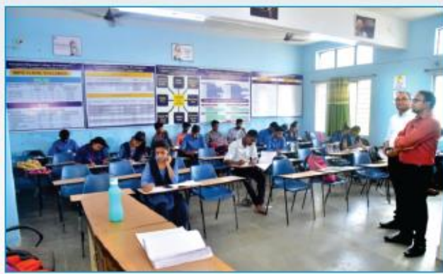
Students at Competitive Guidance Center