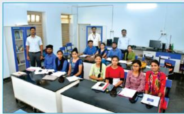
Post Graduate Department of Chemistry and IHLR-SS