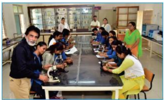
PG Lab, Department of Botany