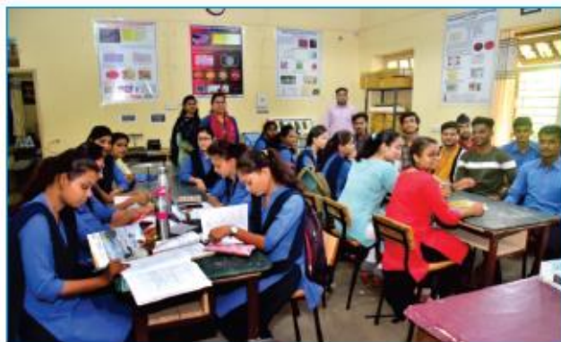
Department of Microbiology