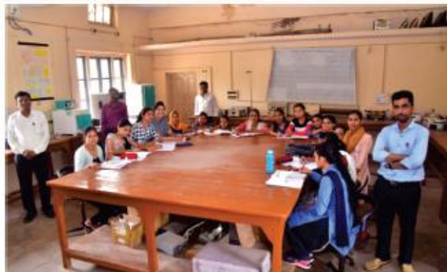
PG Department of Physics