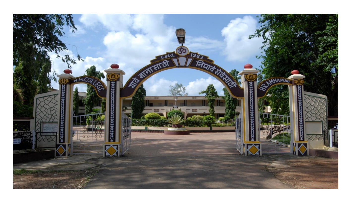
(July 1, 2013 to June 30, 2014)

National Assessment and Accreditation Council, Bangalore (NAAC)