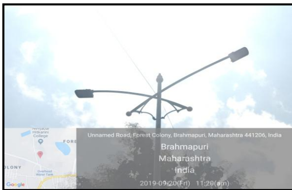
LED Light at college entrance street