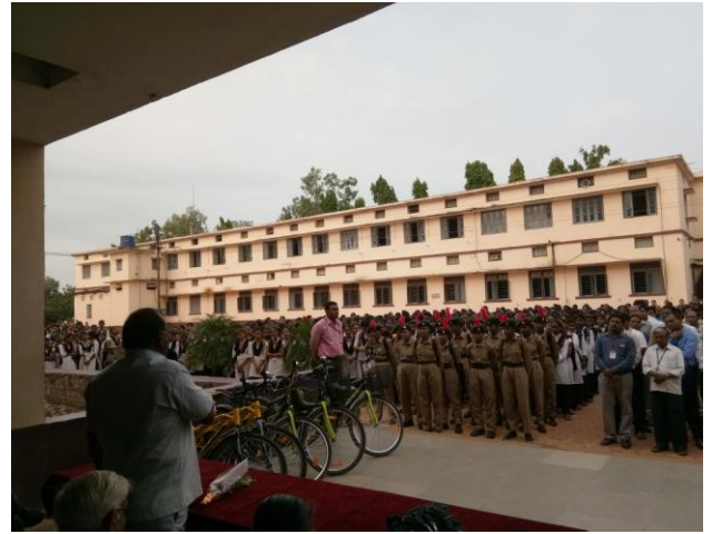
Principal addressing the staff and students