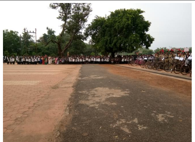
Awareness Rally by Staff and Students