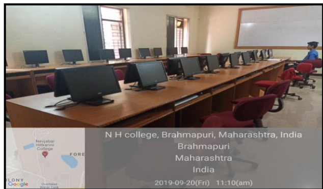
LCD Monitor in Computer lab