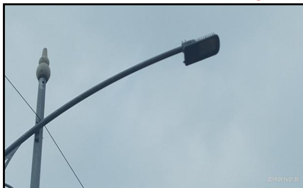
LED Lights at the main entrance of the institution