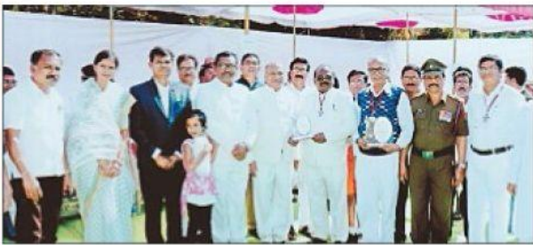
Guests present at the programme.