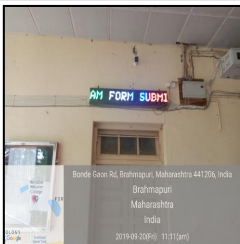
LED running display notice board