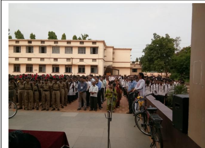
Staff and Students taking oath