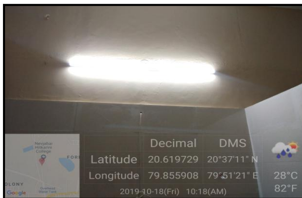
LED Light used in Office area