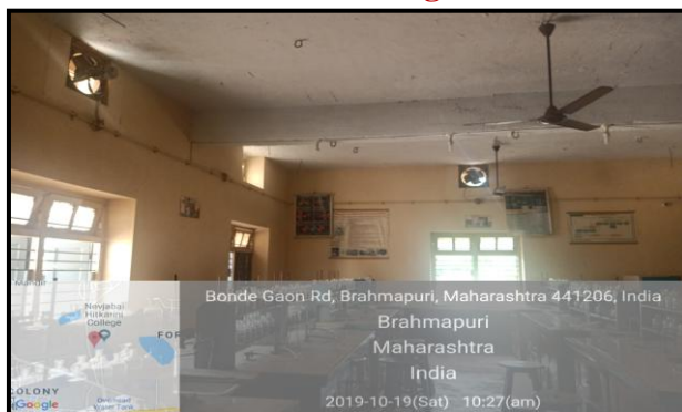
LED and CFL Used in Laboratories and Examination Section