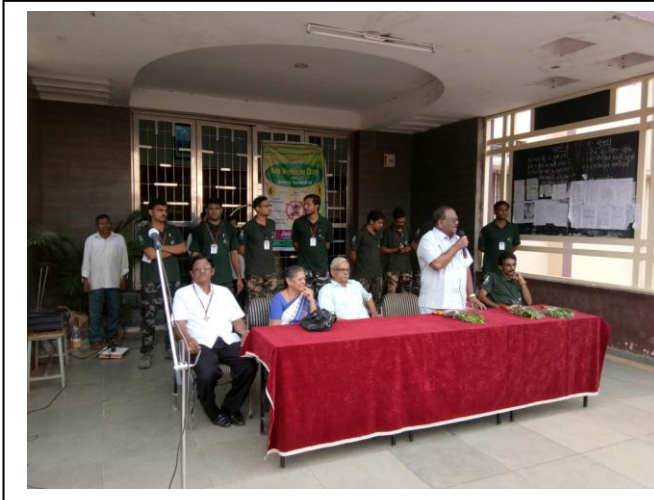
Principal along with Guests