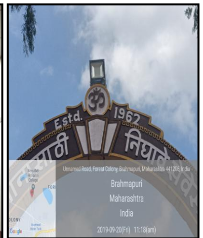
LED Light in Corridor and on Entrance Gate