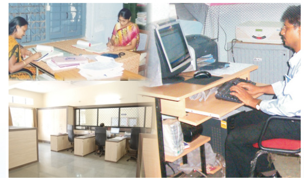
Computerised Admission Section