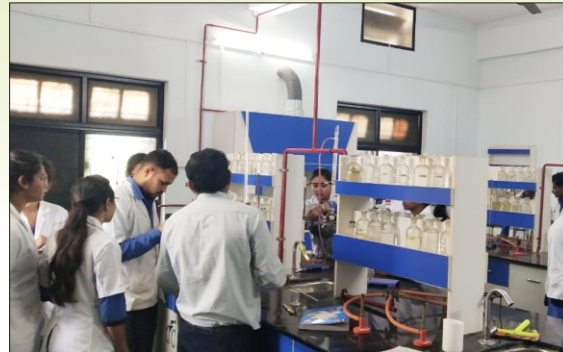
PG Department of Chemistry