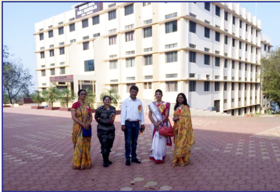
PG New Building