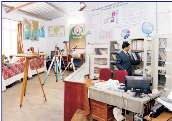
Post Graduate Department of Geography & CHLR