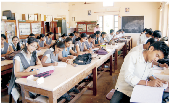
Post Graduate Department of Botany