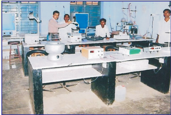
Post Graduate Department of Zoology