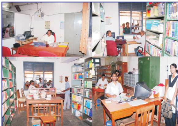
Department of Library & Information Science