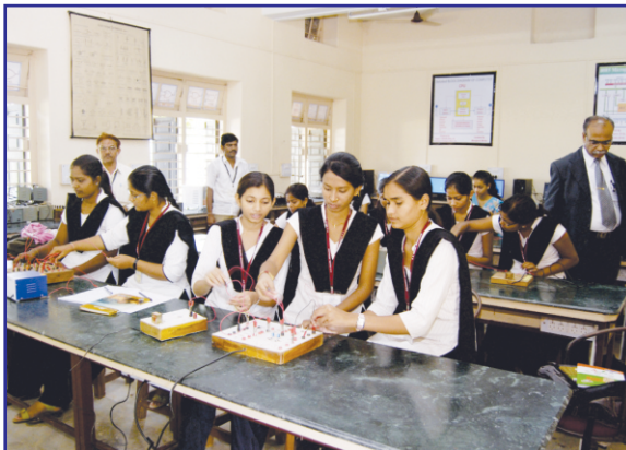
Department of Electronics