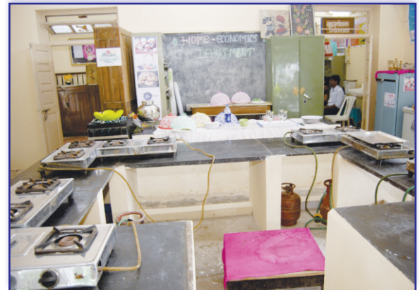
Post Graduate Department of Home Economics