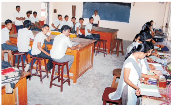
Post Graduate Department of Physics & CHLR