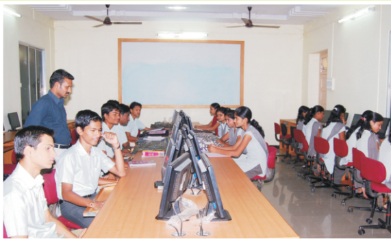
Department of Computer Science